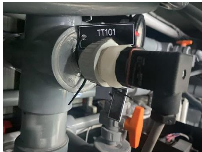
Fig.7.3 Temperature Sensor