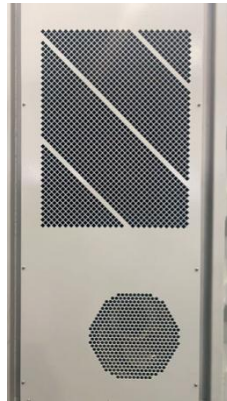
Fig.7.6 Hybrid Thermal Management (Passive + AC Cooling)