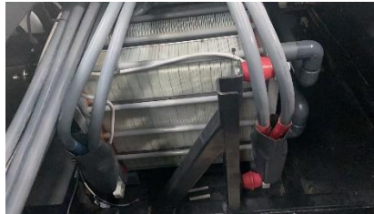
Fig.7.8 Stack Wiring