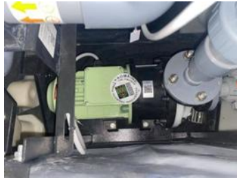
Fig.7.2 Magnetic Pump