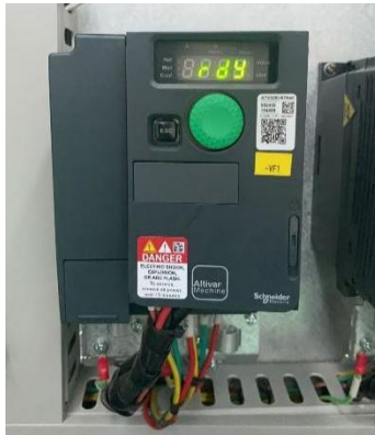
Fig.7.9 Frequency Converter