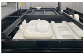
Fig.7.10 Storage Tank