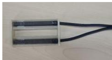
Fig.7.7 Leakage Sensor